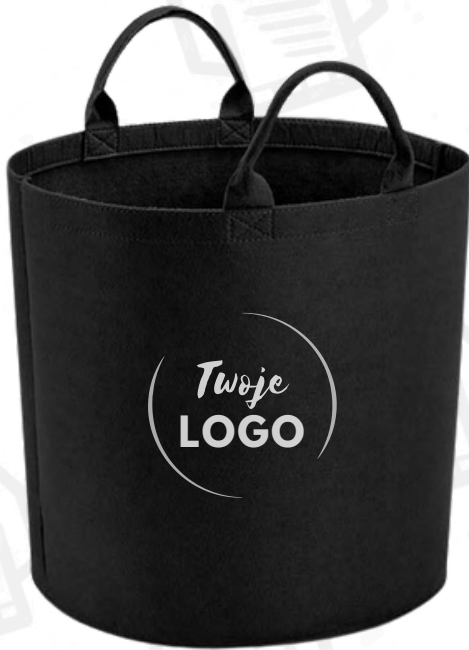
Felt Trug S