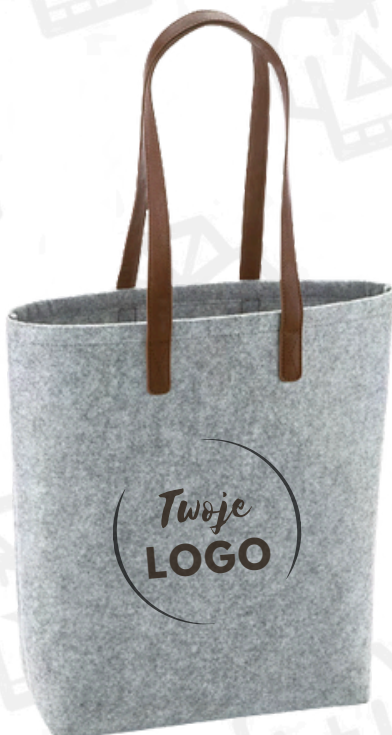
Premium Felt Bag