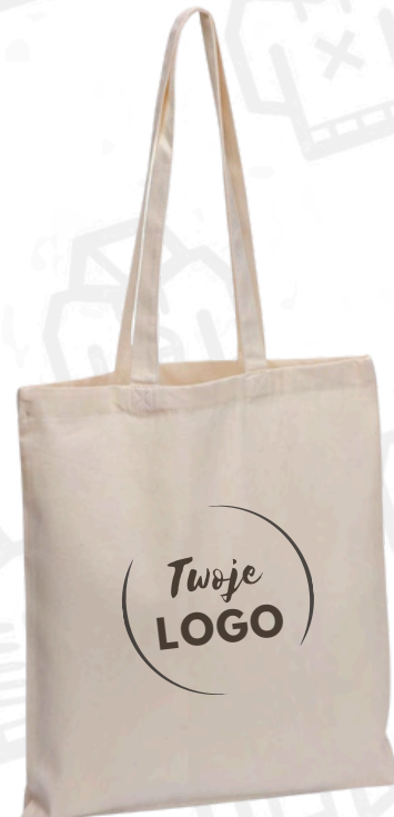
ECO MOONTEX ECRU