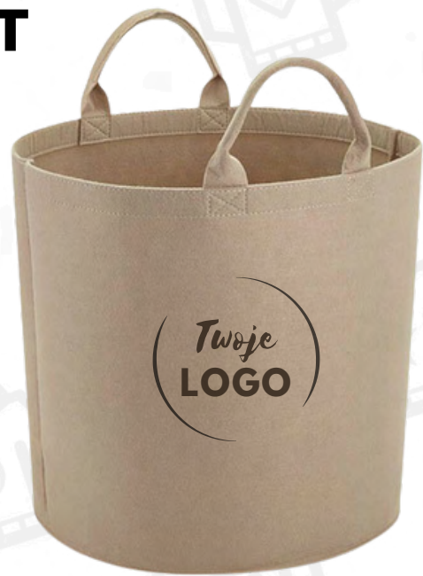
Felt Trug M